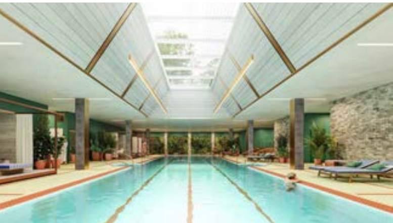
Computer generated image of the pool at King's Road Park, indicative only and subject to change.