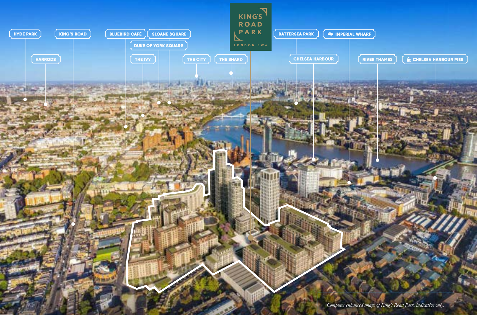
Computer enhanced image of King's Road Park, indicative only.