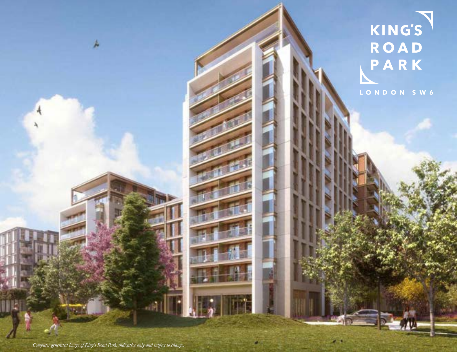
Computer generated image of King's Road Park, indicative only and subject to change.