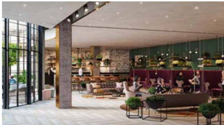
Computer generated image of the residents' lounge at King's Road Park, indicative only and subject to change.